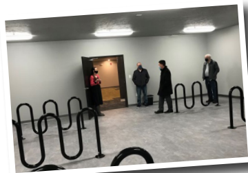
Local officials tour one of the Bike Storage rooms at The River apartment complex.

In the 2008 flood, Mason City lost 163 homes that were part of the FEMA Buy-Out. This total was second only to Cedar Rapids in the loss of Iowa housing stock. Further complicating the situation, the price of building materials more than doubled during the pandemic, and natural disasters such as the derecho, hurricanes, and wildfires have caused supply shortages.