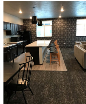
Community Room at The River