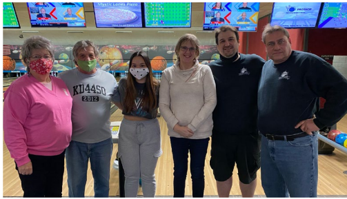
High Series: Mystic Lanes