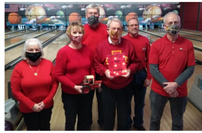
3rd Place Overall: Mason City Red Power