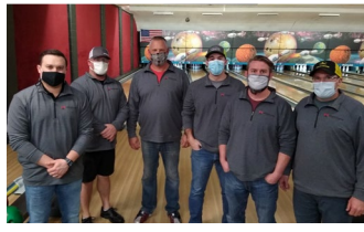
2nd Place Overall: Heartland Asphalt

Congratulations to Mystic Lanes for winning the tournament! Heartland Asphalt and Mason City Red Power came in close behind at second and third place, respectively. The Program Committee thanks to the bowlers for following precautionary guidelines to ensure this was a safe event.