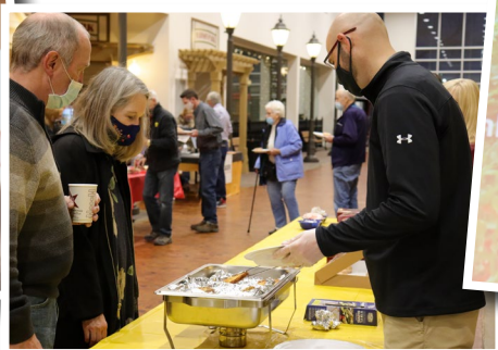
Attendees enjoyed crustless quiche donated by Cargill Protein