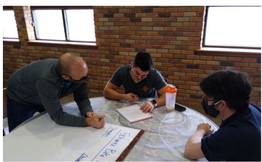
LNI Students discuss project ideas.