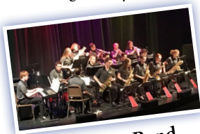
MCHS Jazz Band