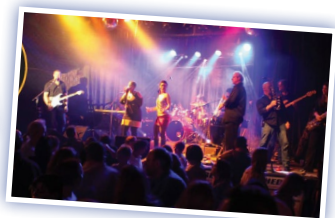
High & Mighty