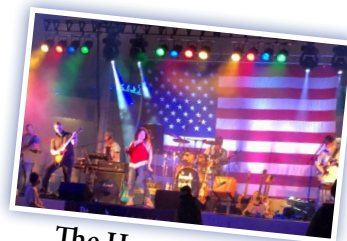
The Hepperly Band