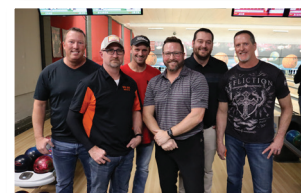
3rd Place Overall: Midwest Construction & Supply