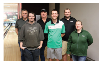
2nd Place Overall: Sukup Manufacturing

Congratulations to Mystic Lanes for winning the tournament! Sukup Manufacturing and Midwest Construction & Supply came in close behind at second and third place, respectively. A complete leaderboard detailing each team's place is listed on the Chamber's website.