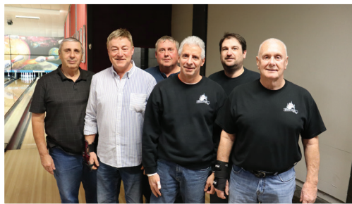
High Series: Mystic Lanes