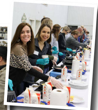
Volunteers served up made-to-order omelets