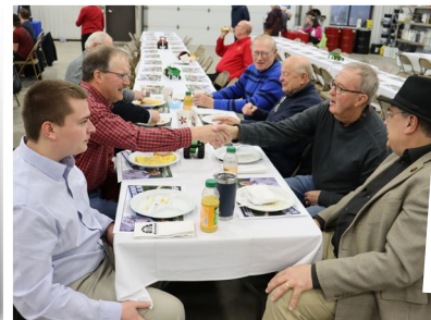
Attendees enjoyed early morning networking and breakfast.