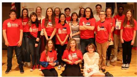
20 finalists from John Adams Middle School and Newman Catholic School competed in this year's event