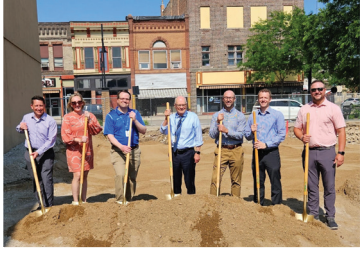
Shyft by Dev Partners Corner of 2nd NE and N Federal