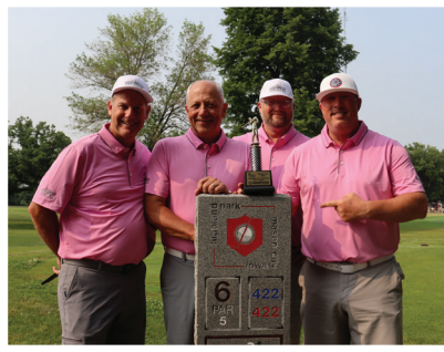
Midwest Construction & Supply was the tournament champion, shooting a 57 over 18 holes.

Thanks to all who participated in this annual 4-person best shot tournament.