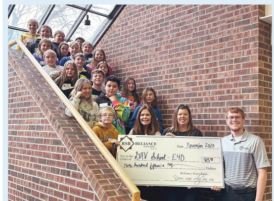
Reliance State Bank presents an Entrepreneur for a Day sponsorship check to a class of Garner-Hayfield-Ventura 5th Grade students