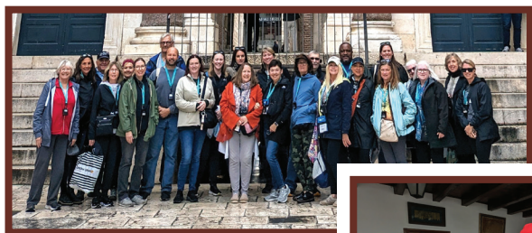
▲ The Chamber Group in Split, Croatia