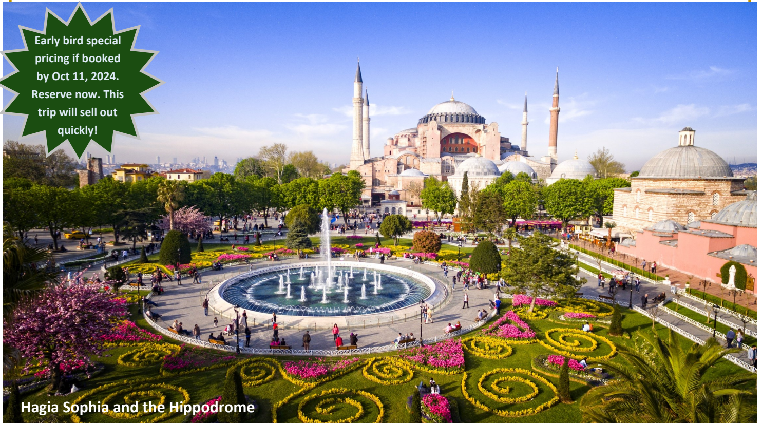
Hagia Sophia and the Hippodrome

Early bird special pricing if booked by Oct 11, 2024. Reserve now. This trip will sell out quickly!