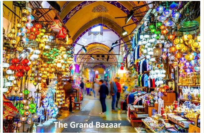
The Grand Bazaar

Day 1 Leave the USA Set off on your overnight international trip to Istanbul. Meals and beverages are served on board.