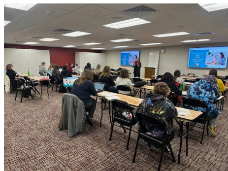
Child Care Ready Class